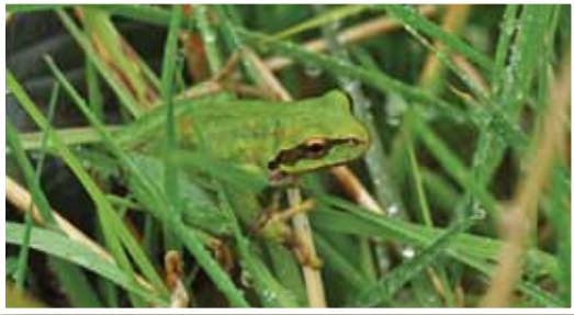
Pacific chorus frog

Bring your kayak, canoe or small boat and launch from Ona Beach State Park. The two-mile paddle meanders up the Beaver Creek valley. Look for beaver, river otter, muskrat, nutria, red-legged frog and Pacific tree frog. Don't have a kayak? Consider a guided-kayak tour. During the summer, South Beach State Park supplies the kayaks, paddles, lifejackets and interpretive host guides. Call (541) 867-6590 for prices, dates and times, and reservations.