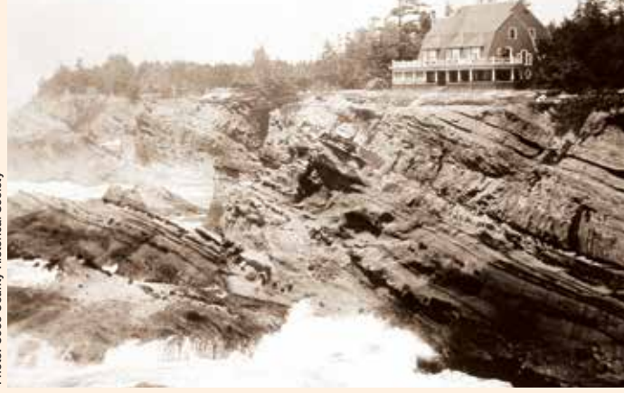
"The showplace that was"

A fully-enclosed observation building now occupies the site of Simpson's mansions, offering spectacular views of