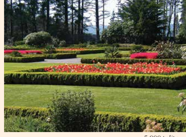
5,000 tulips –Late March through April

Bloom times are based on normal/average conditions at Shore Acres and may vary. If you have questions, please talk to a member of the garden staff or call (541) 888-3732.