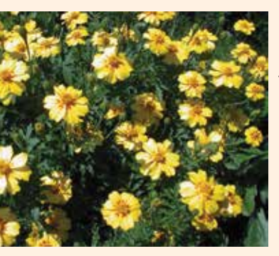
Thousands of flowering annuals/ perennials – May through September

E ver since its beginnings as Louis Simpson's private estate, the plantings at Shore Acres have been designed to take advantage of the area's mild climate. They have created a garden for all seasons—with showy peaks of different kinds of flowers for almost every time of the year.