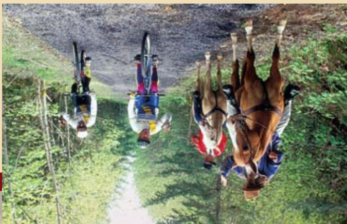
Banks-Vernonia State Trail