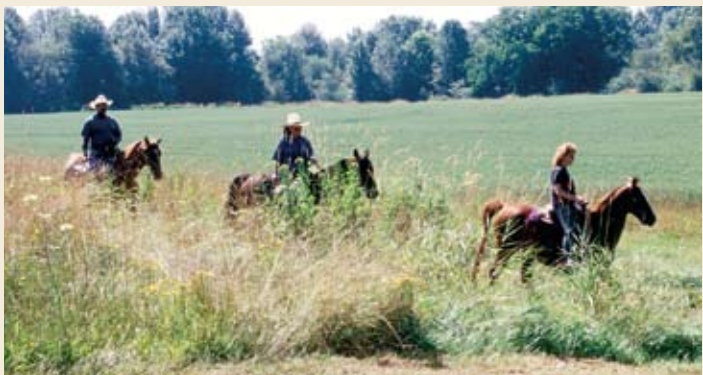
Willamette Mission State Park.

Special Features: Picnic tables, fire rings, vault toilets. Flush toilet nearby. Other Info: The area is subject to flooding from the Willamette River in winter and early spring. The park or trails may be closed due to high water. Before your trip, please call 503-393-1172 to listen to an updated recorded message.