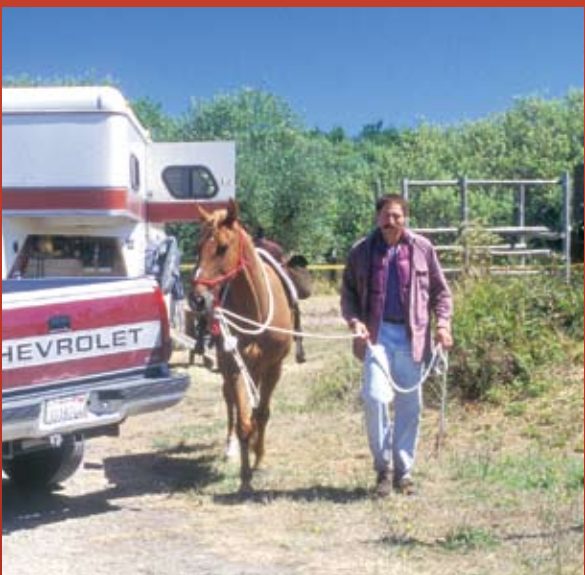
Bullards Beach State Park

Call the State Parks Information Center, 800-551-6949, for additional information on horse trails and horse camping.