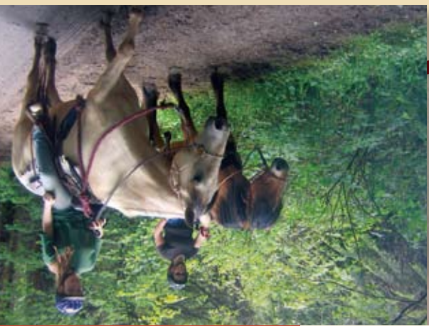
Silver Falls State Park