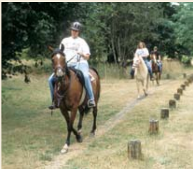
Elijah Bristow State Park.