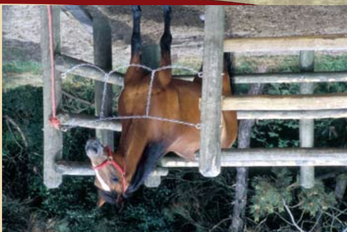
Nehalem Bay State Park