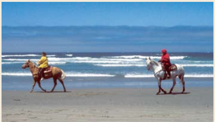
South Jetty—South Beach State Park.