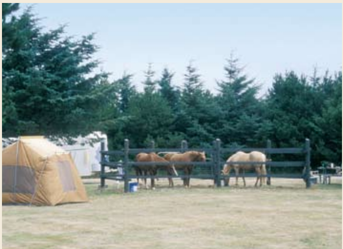
Cape Blanco State Park.