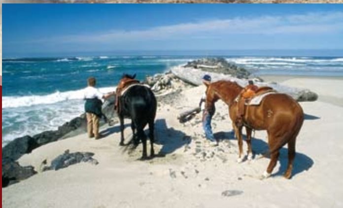
Nehalem Bay State Park

Silver Falls State Park , 26 miles east of Salem. More than 25 miles of multi-purpose trails wind through Oregon's largest state park, making it a natural destination for guided horseback tours.