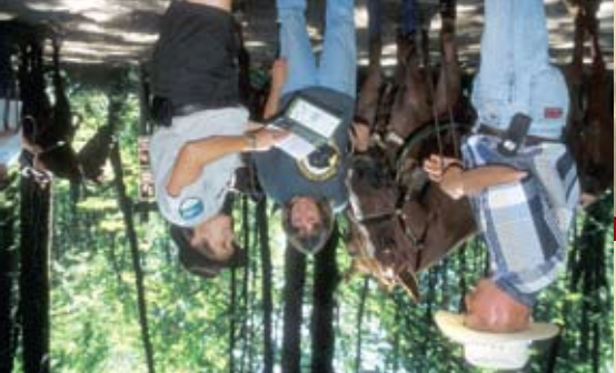
Tryon Creek State Natural Area