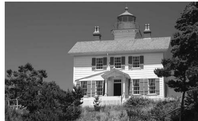
Yaquina Bay Lighthouse

Beaver Creek State Natural Area: Located just eight miles south of South Beach State Park, Beaver Creek offers additional hiking trails and an ADA-accessible visitor center.