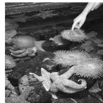
Oregon Coast Aquarium

Oregon Coast Aquarium: Marine creatures and exhibits showcase the beauty and diversity of sea life along the Oregon coast. The aquarium is within 1.5 miles of the park.