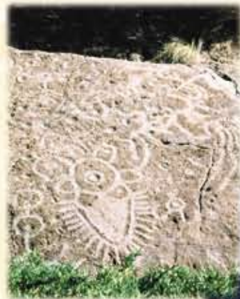
Left: Crooked River Petroglyph. Below: Lake Billy Chinook.

Located in the heart of central Oregon and encompassing the Deschutes and Crooked River canyons, this park epitomizes the majesty of central Oregon's semiarid environment. From the peaceful waters of Lake Billy Chinook to the peak of Mt. Jefferson looming in the distance, this park offers breathtaking views that visitors never forget. Extensive hiking trails allow visitors to experience the beautiful scents, sounds and scenery of Oregon's high desert.