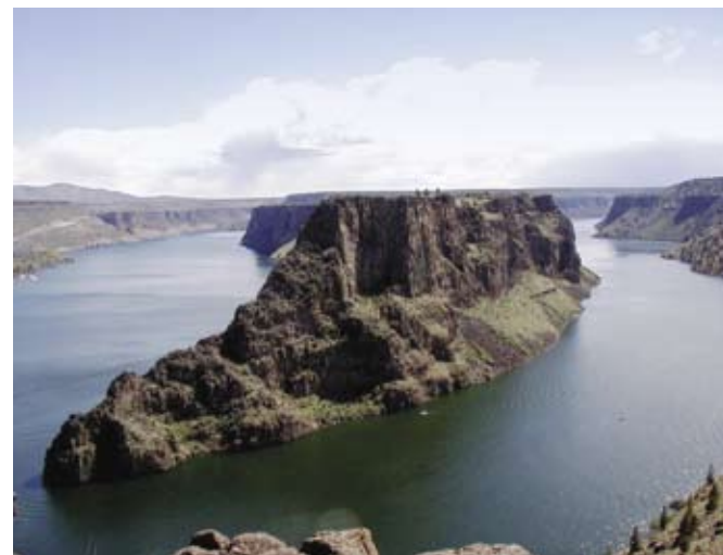
The north tip of The Island viewed from the Tam-a-láu Trail.

(called The Peninsula), the trail gains 600 feet in elevation. On the way up, you will pass through areas rich in wildlife and unspoiled native vegetation, as well as three unique geological formations. At the top, the trail makes a 3.5-mile loop around The Peninsula, which affords spectacular views of the high Cascade Mountain peaks and the Deschutes and Crooked River canyons. Imagine what it was like for early homesteaders trying to live off this harsh and unforgiving landscape. Remember not to disturb or remove any rock structures you encounter while on The Tam-a-láu Trail.