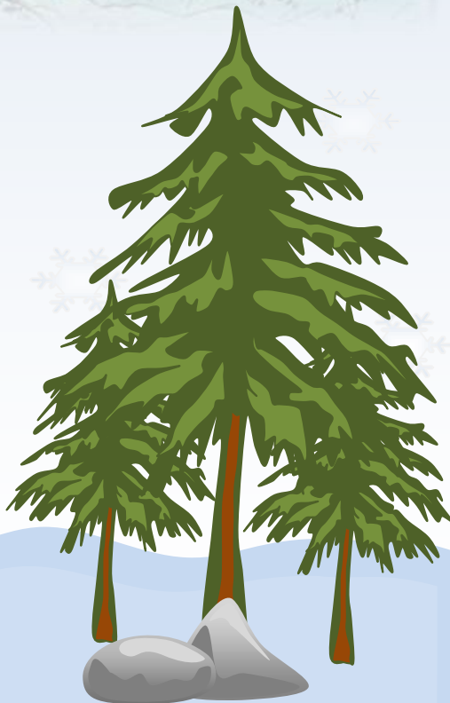
Columbia River Gorge